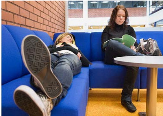
Students at the Kuopio Campus Library